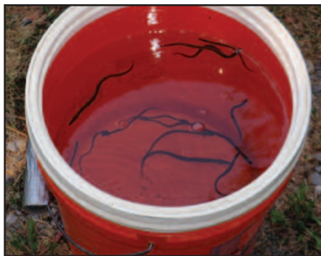
Eel release in Buffalo Creek