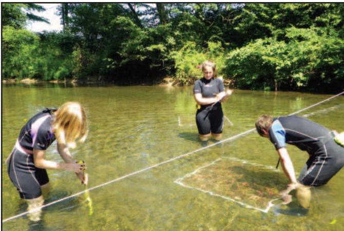
Lycoming College Students of Dr. Petokas monitoring stream for the Eastern Hellbender.

The two locations where the hellbender seems to be doing best are in the West Branch Susquehanna River sub-basin and in northern Georgia. Current results indicate that most existing West Branch populations are stable and self-sustaining, but at least one major population has declined precipitously in the past six years. Possible causes of the declines are diseases such as amphibian chytrid fungus, chemical pollution including endocrine disruptors, and invasive species such as the rusty crayfish. Habitat degradation has also limited where hellbenders can survive in Pennsylvania waterways.