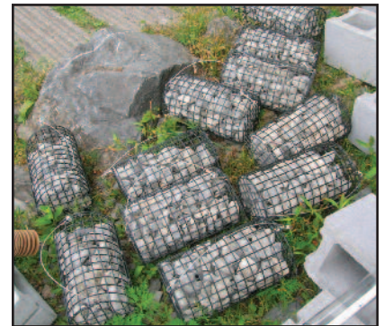
Rock baskets on bank of Susquehanna ready for submersion