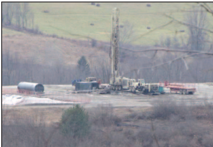
Well pad being constructed

Gas exploration and development companies from across the country are now working in Pennsylvania to drill into this formation and extract the natural gas, which is a relatively cleaner fossil fuel than coal. The drilling is having a profound effect throughout the Appalachian plateau of Pennsylvania. Development of the deep wells and the well sites — including construction of the entire supporting infrastructure: roads, compressor stations, pipelines, etc. — is just beginning to ramp up.